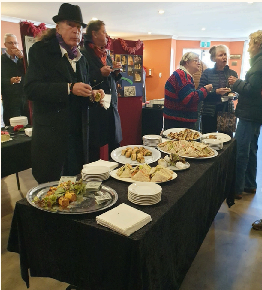
Members share food and stories