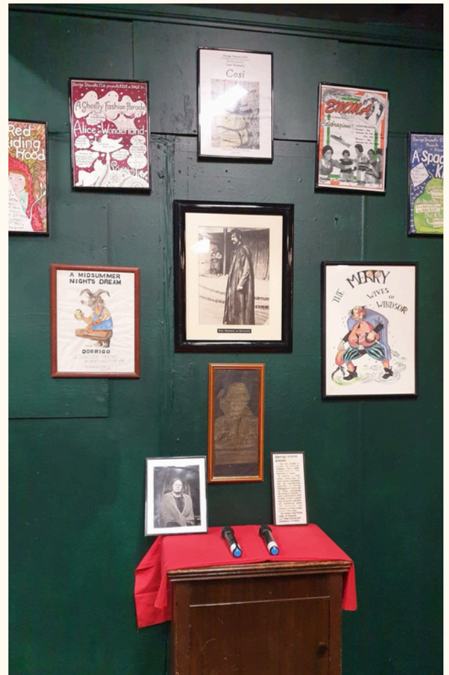
Past production posters