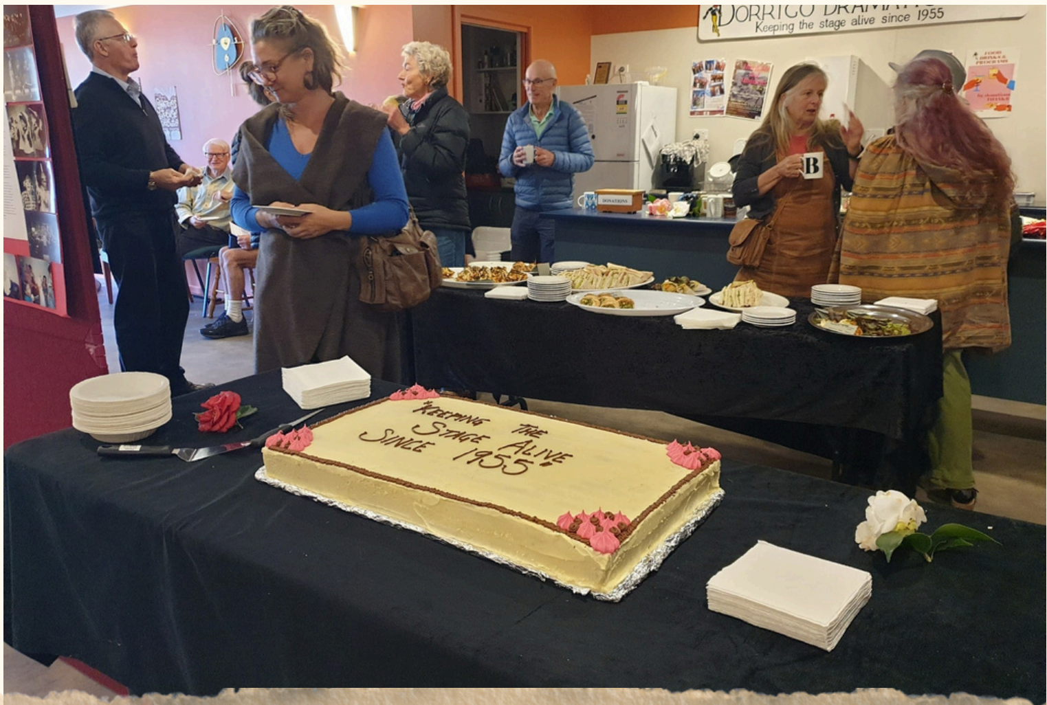
The 70th Birthday Cake made & iced by Dorrigo Bakery