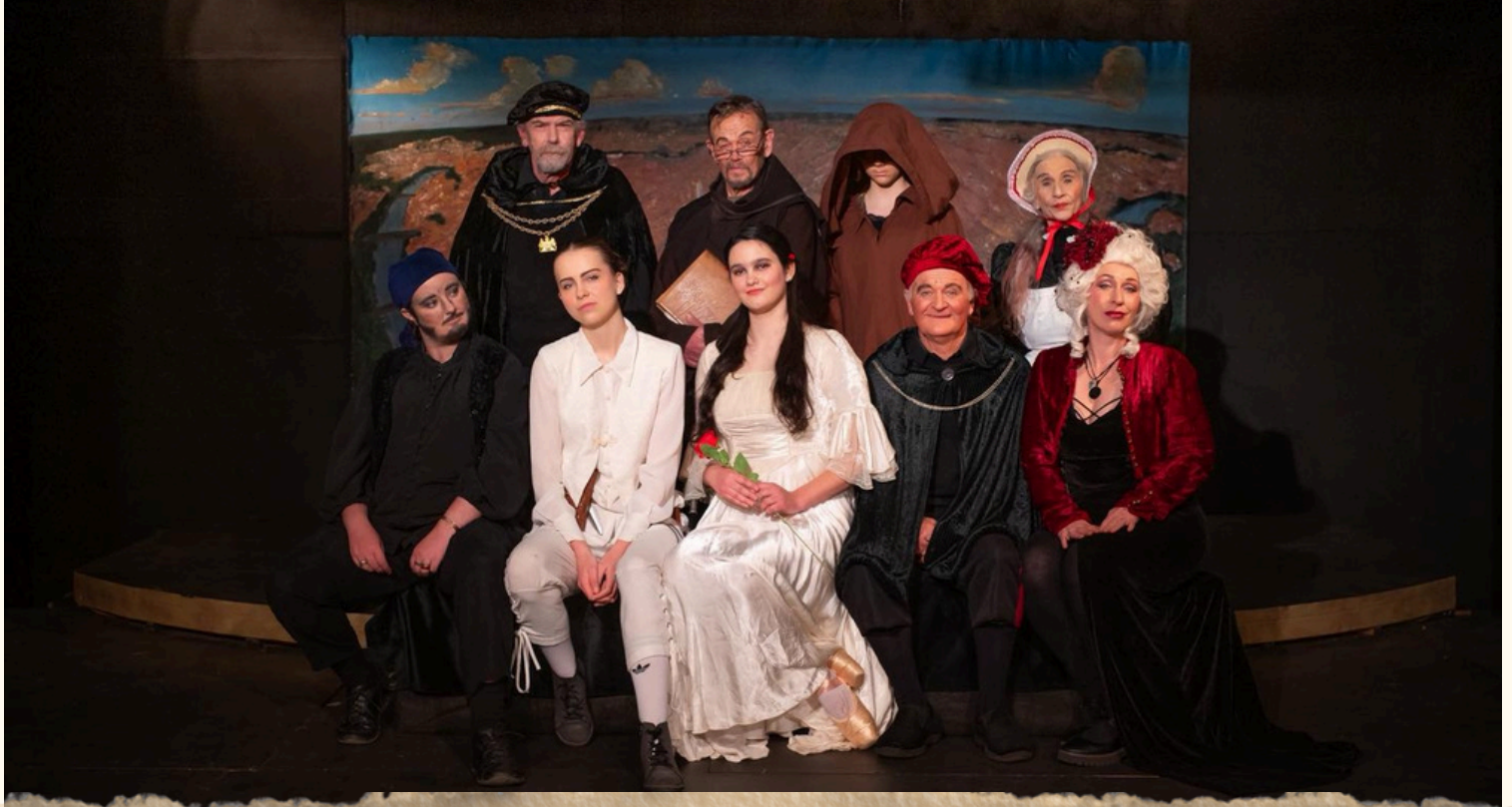
The cast of Romeo and Juliet